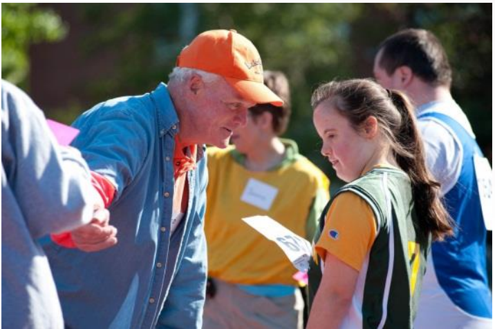
Bottom Right: Coach getting athlete ready before track race