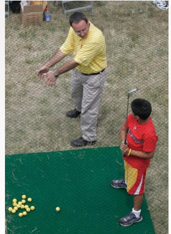
Above: Coach demonstrating the grip of a golf club to an athlete