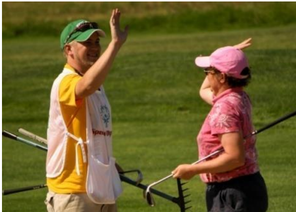
Left: Caddie congratulates an athlete at a golf competition.

Our challenge as coaches is to develop a full understanding of our athletes and what they bring with them to a Special Olympics program.