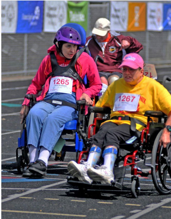
Above: Athletes during a race.