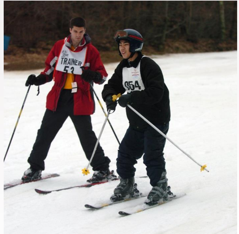
Above: Athlete and trainer working on alpine skiing.