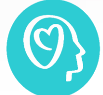
STRONG MINDS (emotional wellbeing)