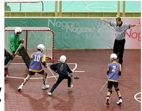
Right: A poly hockey official calls 'no goal'