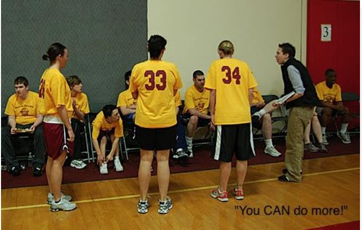
Top Left: Basketball coach talking to team on sidelines